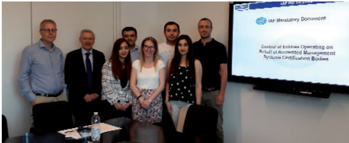
Study tour to Accredia (Italy), June 2019

Study tours to LATAK (Latvia) and Accredia (Italy) were organized to observe how the accreditation process takes place in the national accreditation bodies signatories of EA MLA - Multilateral Agreements. Development of an updating AzAK internal management system procedures was also achieved.