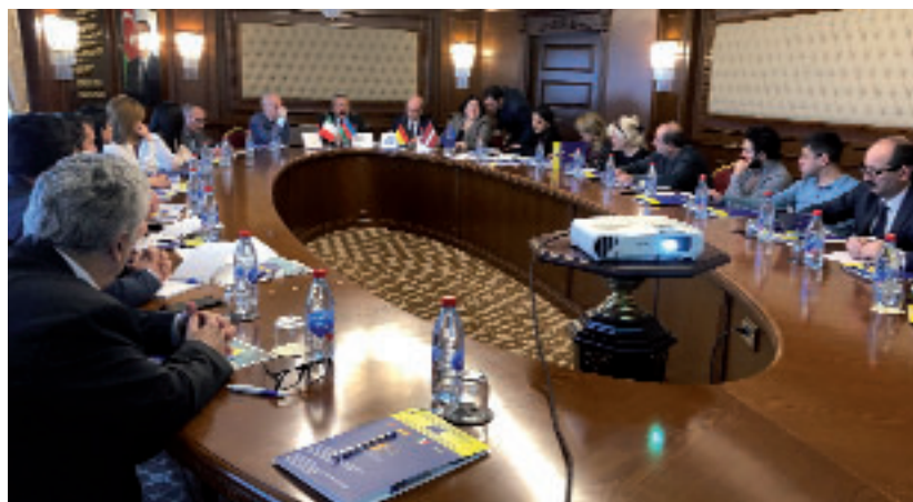
Workshop “The benefits of accreditation”, Shamakhi, January 2019

In June 2019, MS experts met the staff of the President of the Republic of Azerbaijan, to discuss recommendations for the Secondary Legislation, and intensively with regards to the technical background and with the perspective of the EA peer evaluation process.