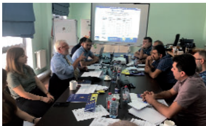
Training on ISO 45001 and IAF documents, July 2019