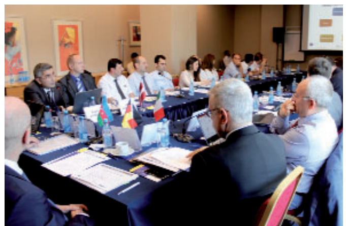
Workshop “The benefits of accreditation”, Baku, June 2018