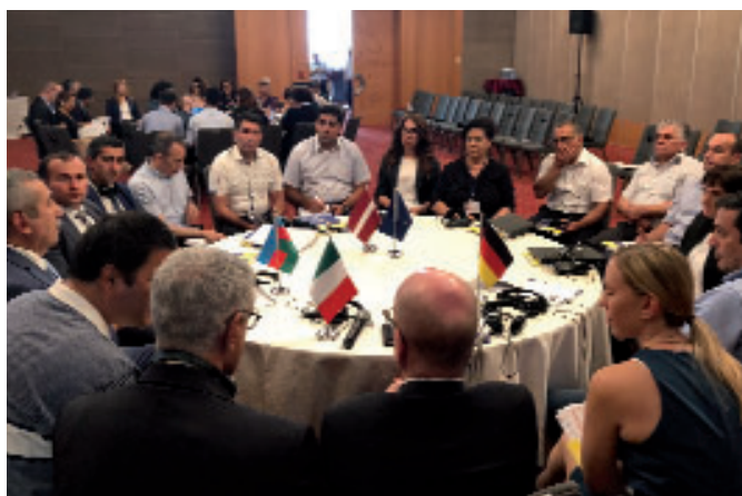
Workshop “Regulation EC 765/2018”, Baku, June 2018

A project for the development of the new AzAK website was developed and the institutional brochure of AzAK was realized in English and Azerbaijani languages.