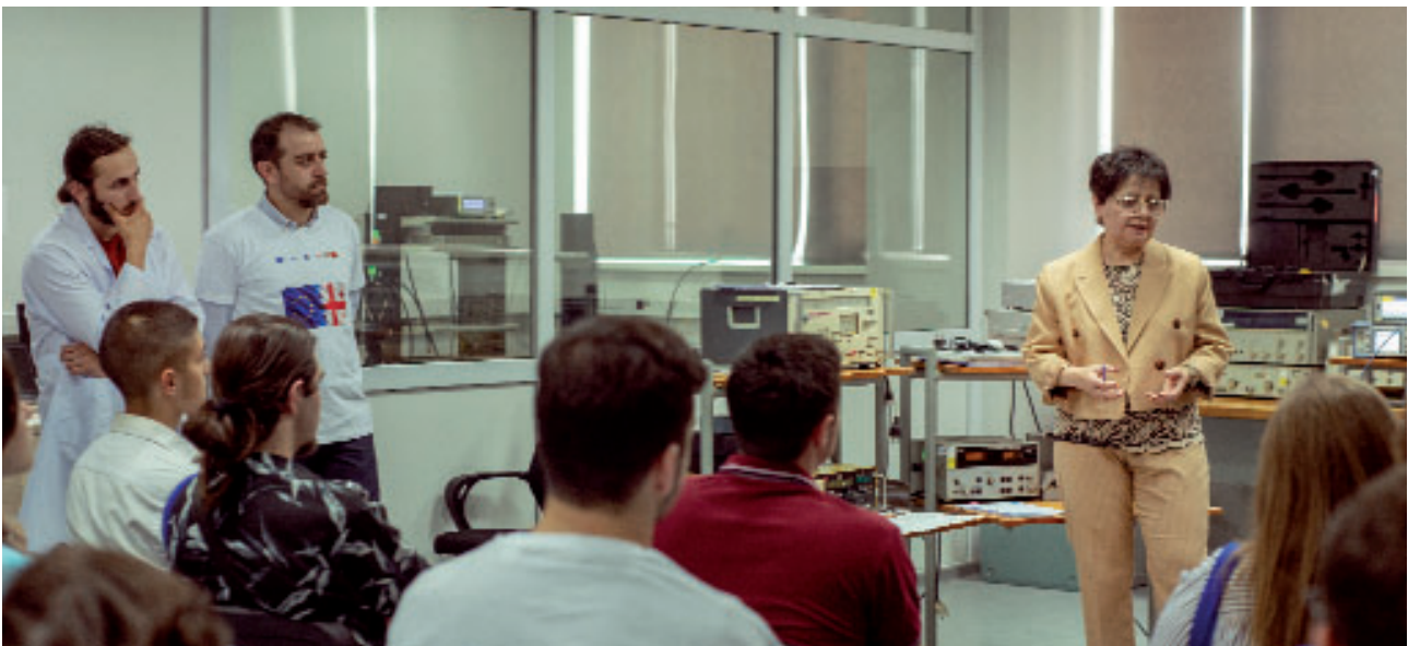
School students visiting the GEOSTM Radiophysics, Optics, and Acoustics Reference Division during the Open Door Event.

On the same day, the Open Door Event provided the opportunity for representatives from the business, academic, and scientific sectors to get familiar with the GEOSTM services and to receive theoretical and practical information from the National Agency's experts in the following areas: Standardization, Electricity, Thermometry, Mass, Pressure, Radiation, Acoustics, Geometric Measurements, Mechanics, and Physical Chemistry.