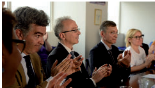
Participants in the Mid-Term Conference of the EU GEOSTM Twinning Project.

The EU Twinning Project Mid-Term Conference presented the results achieved by the Project and their impact/relevance for the GEOSTM stakeholders. This milestone conference was attended by the Ambassador of Italy to Georgia, the Chargé d'affaires a.i. of Spain to Georgia, the European Union Delegation (EUD) and the representative of the Program Administration Office in ENI countries (PAO).