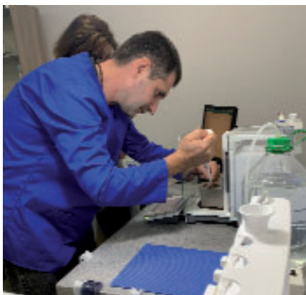
EURAMET Peer Evaluation in Mass and Related Quantities Reference Division.

The general opinion of the team members was that GEOSTM has an adequate Quality Management System, the implementation of which demonstrates conformity with the requirements of the CIPM-MRA.