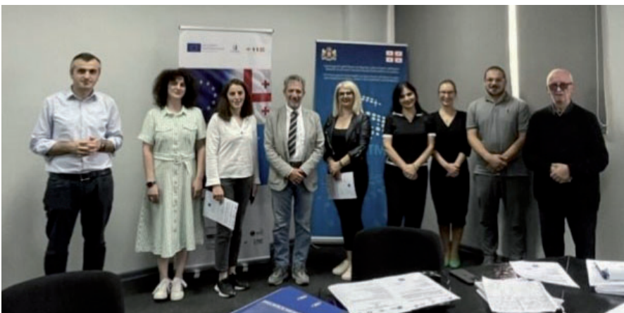
Participation of the GEOSTM Standardization Department staff in the QMS Auditor-Lead Auditor Training Course.

Developing the necessary Quality Management System (QMS) documentation and implementing the QMS is one of the components of the TW Project involving Georgia, Italy, and Spain. Therefore, the QMS documentation, as revised after the pre-assessment, was reviewed, and the next steps for the QMS implementation were defined.