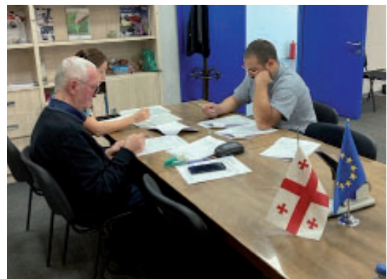
Working Process of the GEOSTM Standardization Department's staff in the QMS Auditor-Lead Auditor Training Course.

The course was followed with great interest. At the end of the course, participants who successfully completed the two-hour exam were awarded the internationally recognized QMS Auditor certificate.