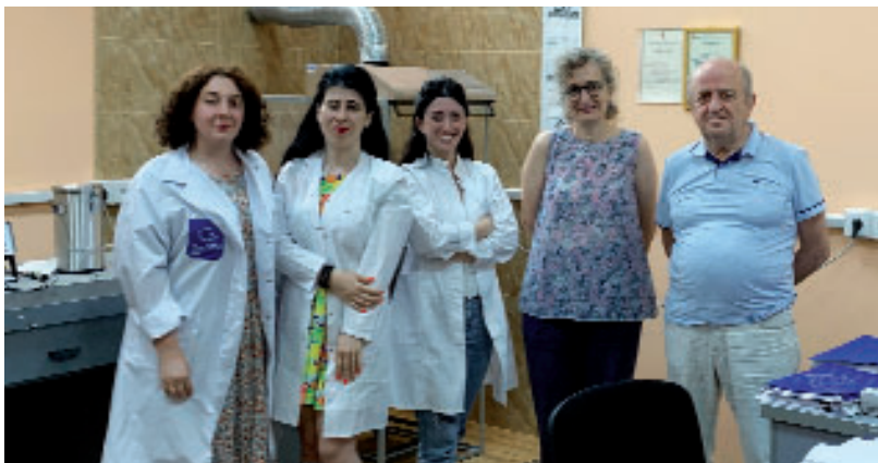
EURAMET Peer Evaluation in Physical Chemistry Reference Division.

Almost all the measurement and calibration capabilities (CMCs) published in the KCDB (60 entries out of 65 CMCs) for the relevant quantities were verified during the audits. The audited laboratories did not reveal any findings that could prevent them from being fully operational. An appropriate corrective action plan was submitted by GEOSTM and approved by the audit team.