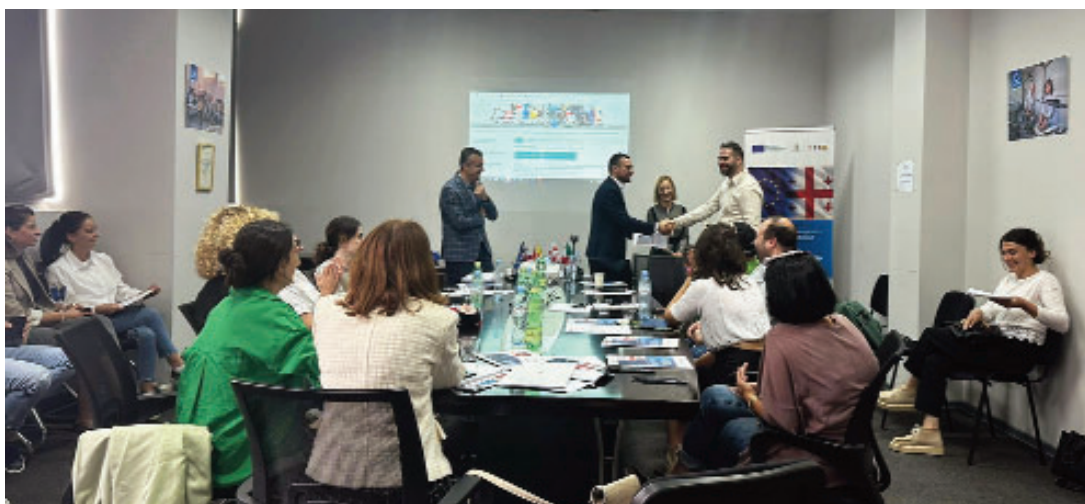
The Workshop for stakeholders under Directive 2009/48/EC Toys Safety.

In the framework of the Project Activity: 3.3.3 - Comprehensive training/seminars on the application of relevant standards under Directive (2009/48/EC) on the safety of toys, a successful workshop for stakeholders on harmonized and related standards under Directive 2009/48/EC on toys safety was organized.