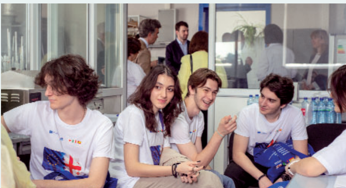
Students visiting the GEOSTM Physical Chemistry Reference Division during the Open Door Event.

The double event was a great success, achieving all the objectives set.