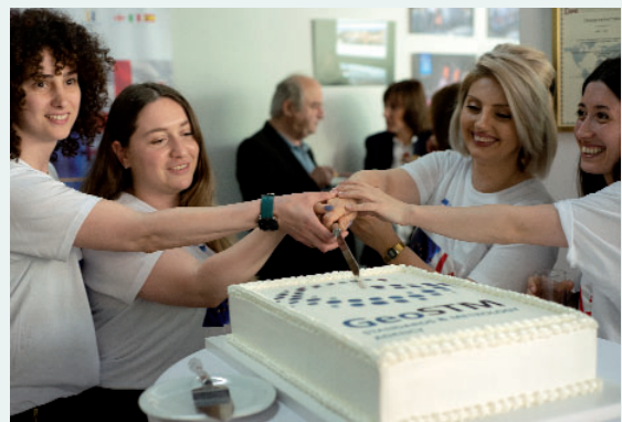
Cutting the celebration cake at the GEOSTM Open Door Event.